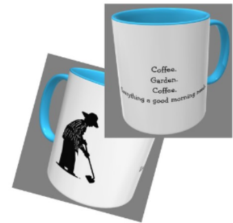
Coffee cup in Robin's Egg Blue. $15/ ea.

2-pockets, 100% cotton twill. Measures 31" long x 29" wide