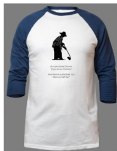
Navy Baseball T-Shirt $25/ ea.