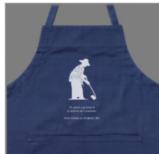
Cotton Twill Apron in Navy $25/ ea.

2-pockets, 100% cotton twill. Measures 31" long x 29" wide