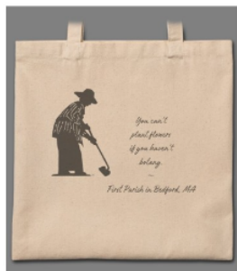
Everyday Canvas Tote $12/ ea.